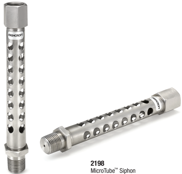
2198 MicroTube™ Siphon

Max Allowable Working Pressure: 5,000 psi at 800°F (427°C)