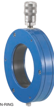
TYPE 80 ISOLATION-RING